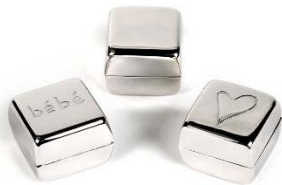
Baskerville and Saunders

Ceremonies and occasions have always been key to the gift buying market, and Nigel predicts that they will continue to grow in importance: "In addition to the traditional ceremonies of Christmas and Easter, romantic occasions are increasingly key: Weddings represent a huge market and Valentine's Day can be the second biggest retail event of the year". Nigel explains that "part of the reason is a sense of continuity in a changing world". From greeting cards, to fashion accessories and food gifts, these occasions span through the entire gift market. Nigel also adds that "the whole world of glamour and romance is very important to our industry and there is great product coming through."